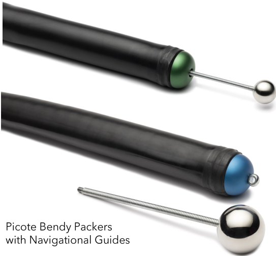
Picote Bendy Packers with Navigational Guides

The Picote Bendy Packers are part of the Picote Pro Packer series and are specially designed for repairs in pipe bends but work great in straight sections too! These Packers can be pushed through several bends to the renovation location using the innovative and patented Front-Wheel Drive System. This allows them to travel longer distances and easily navigate through multiple 90° bends.