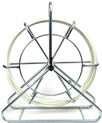
Front Wheel Drive Glass Fibre Rod

* Customized Push Rod Adapters available, please contact Picote.